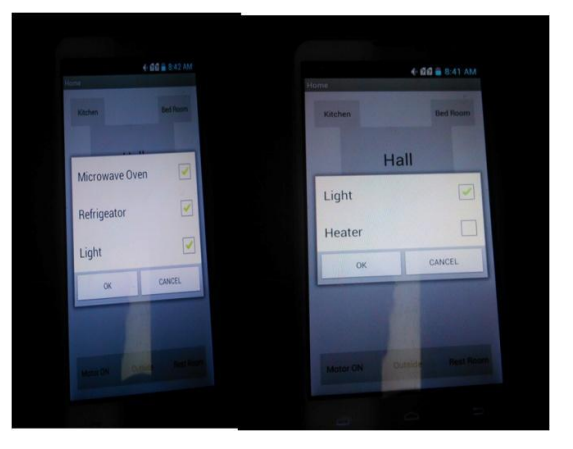
Figure: android application

Fig 2 shows android application created in mobile.